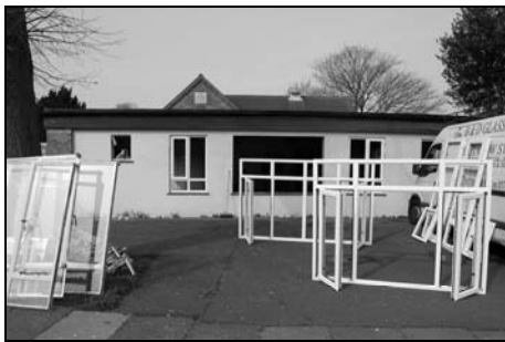
(Above) The scene outside the church halls last month when the old metal windows (seen left - installed when the halls were extended in the 1950s) were removed and replaced with double glazing.

Yvonne Jeffries (020 8599 7250) Fish & Chip Supper - Bring your own drink.